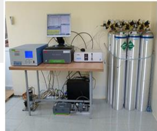
CATCOS GHG and O 3 measurements, Vietnam